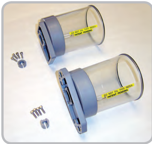
AMR Adapters for Dresser Series B3 meter